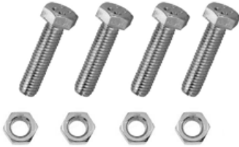
M-sizes bolts & nuts vs. flange types & sizes